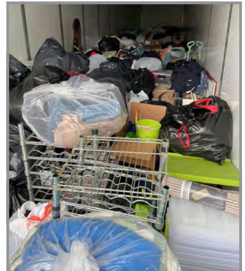
The Rotary Club of Upper St. Clair-Bethel Park's clothing drive for the City Mission (above and left) was a huge success. With assistance from the wonderful people in their communities, they filled a 53 foot trailer with lots of goodies!